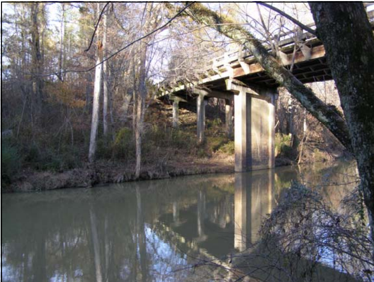
Winter on Five Mile Creek

Five Mile Creek has suffered from decades of industrial, mining, and urban pollution and impact. After the devastating floods of 2001-2003, the communities along Five Mile Creek began to seek a solution to the problems of “Creosote Creek”. The Five Mile Creek Greenway Partnership was formed to protect and preserve the water quality and quality of life for residents along Five Mile Creek by protecting streamside buffers and planning for “smart-growth” within the watershed.